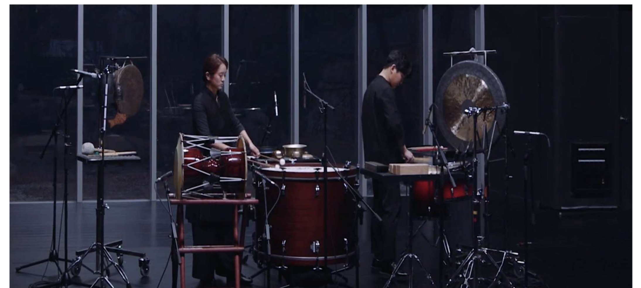
PINE TREE WITH THREE ROOTS